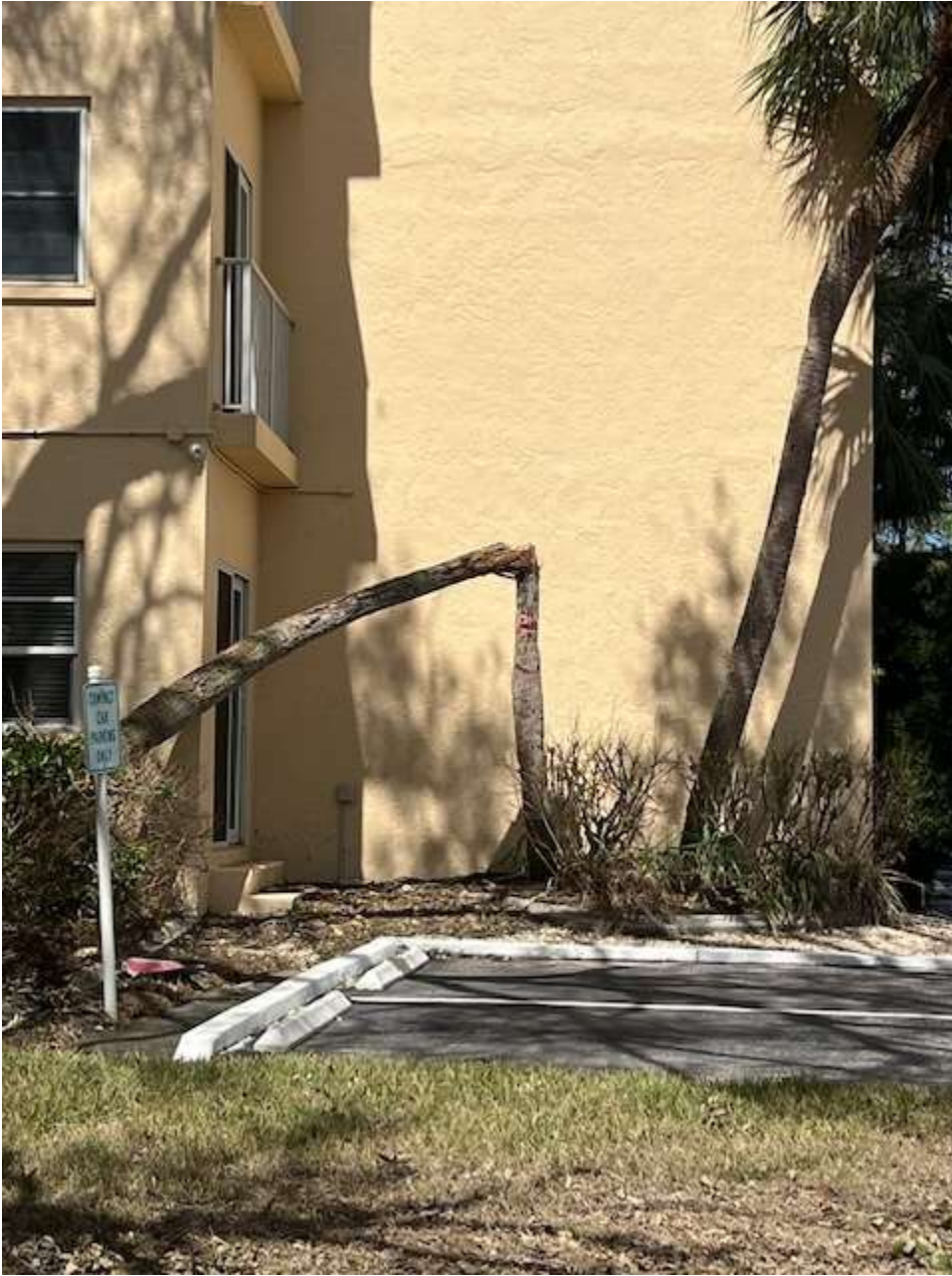
Outside C 108